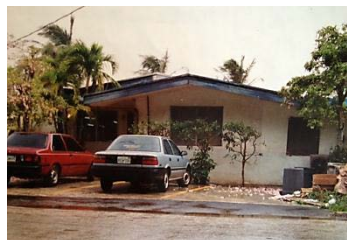
The first law library building.

In 1978, the Guam Territorial Law Library was established with the enactment of Public Law 14-155. A year later, construction began and the first Guam Law Library was born. The library building still sits on the same location on San Ramon Street, behind the Judiciary of Guam complex.